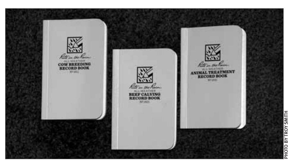
Rite in the Rain is an all-weather writing paper that sheds not only rain, but humidity, sweat, blood and other liquids associated with working in the cattle industry.

GrowSafe Systems of Airdrie, Alta., has made its name known to beef researchers and producers worldwide since introduction of its GrowSafe feed intake and behavior monitoring units in 2000. The company took that experience and knowledge to the next level by developing GrowSafe Beef (GSB) — an automated watering system that monitors the growth and health status of as many as 300 animals in pens at commercial feedlots. Since 2007, GSB units have been in use at feedlots cooperating with GrowSafe to validate the system's capabilities, the GSB watering systems are now becoming commercially available. Get more information at www.growsafe.com.